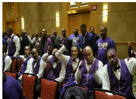
Mu Nu Chapter 68 th 2 nd District Conference All Black Weekend