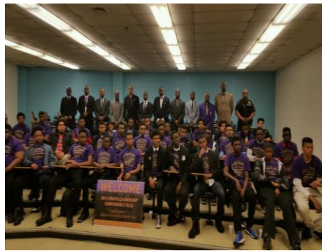
Omega Psi Phi Fraternity 68 th 2 nd District Conference Youth Leadership Conference 2016