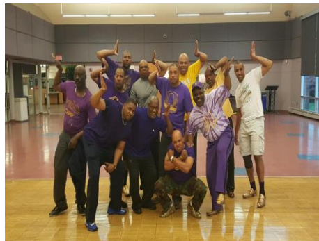
Mu Nu Chapter 68 th 2 nd District Conference Step Team